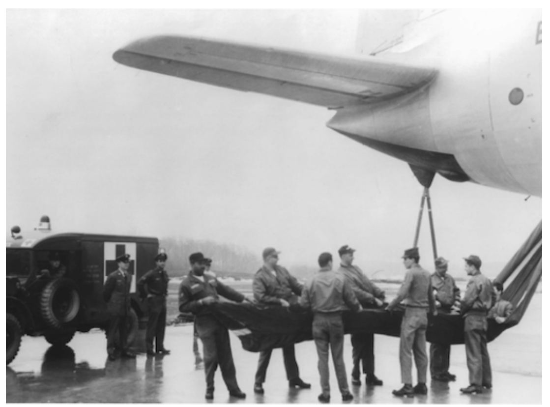
336 MAS loadmasters practicing emergency evacuation chute slide techniques shortly after mobilization, 1968.

Performed aerial refueling worldwide, 1977.